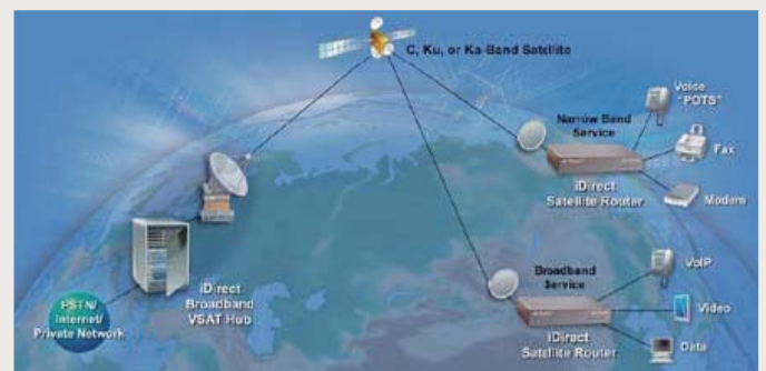
Broadband à la Carte service, shown as shared capacity across a number of user sites